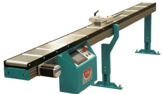
Screen of TYRObut